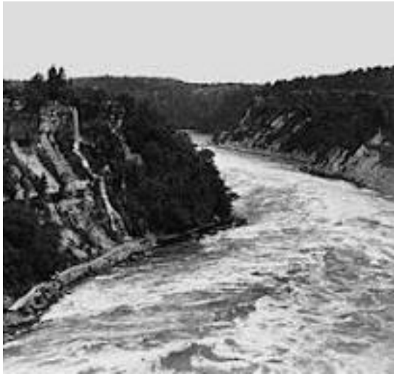
Photo of Muddy Run Falls Circa 1920

People can support the campaign by making a donation on the Library's website or by going to the Victoria Avenue branch.